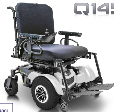
Q1450 with Synergy® Seating